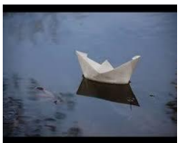
The boat is on top .

Make a paper boat and put it to float ON TOP of some water in a sink. Then put something INSIDE your boat and see if it will stay afloat. What made your boat go UNDER the water?