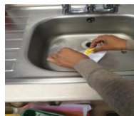
The toy is in the boat.