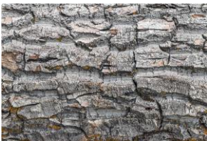
bumpy, rough, hard

Can you find objects that have different textures ? Have a go at finding groups of objects! How many of each texture did you find?