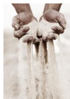
dry, soft, grainy