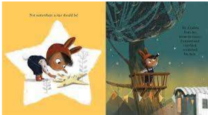
One dark night.....