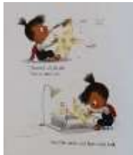
Then every day.....