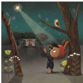
Eventually, one night .....