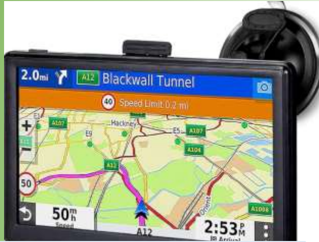
Road map on a car sat nav

A map is a drawing of different parts of earth. World maps help us identify the different countries. Road and tube maps helps us identify where we need to go.