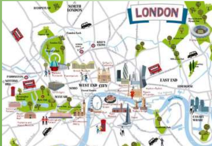
Children's map of London