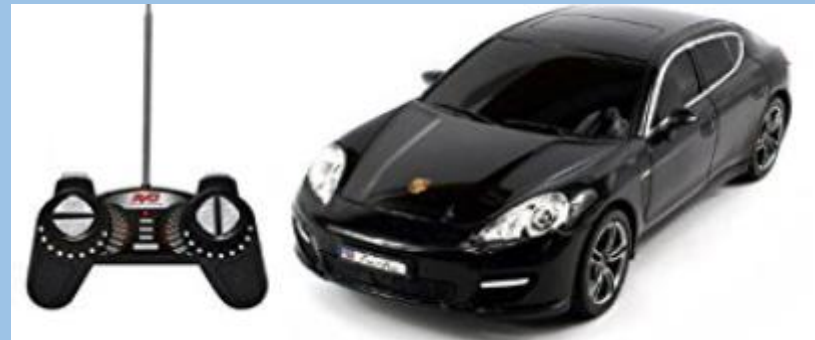
Remote control car