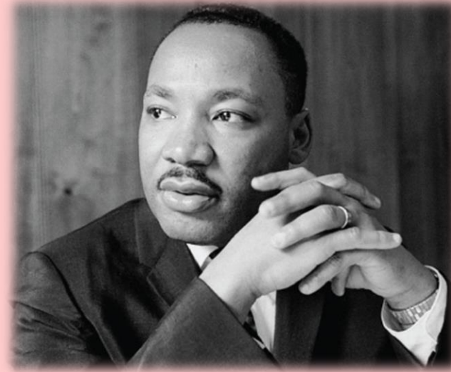
Dr Martin Luther King Jr