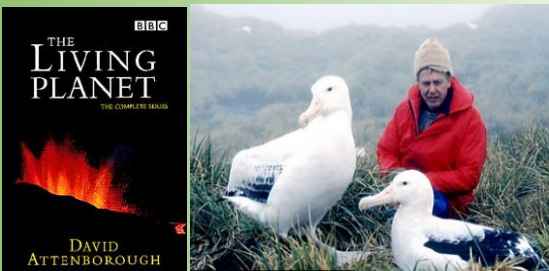
The Living Planet