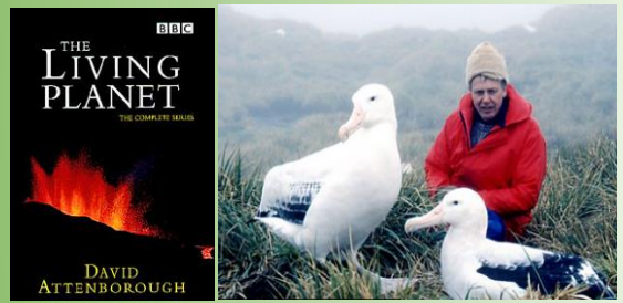
The Living Planet