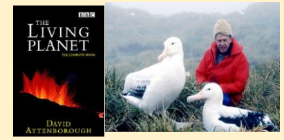
The Living Planet